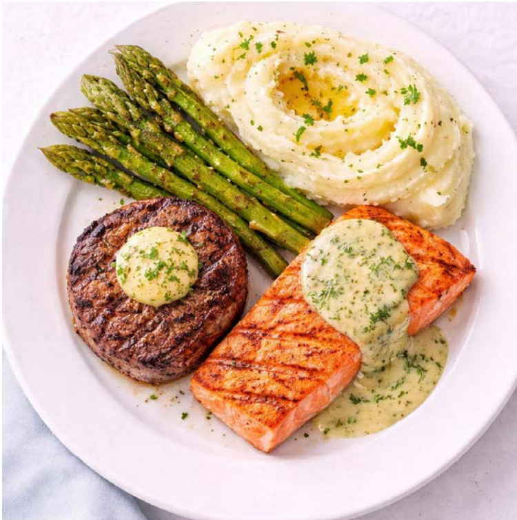
Filet Mignon and Salmon Duo Plate

Must be selected for guest count above 130*