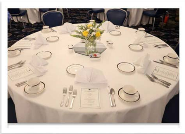
A Formal Plated Table Setting