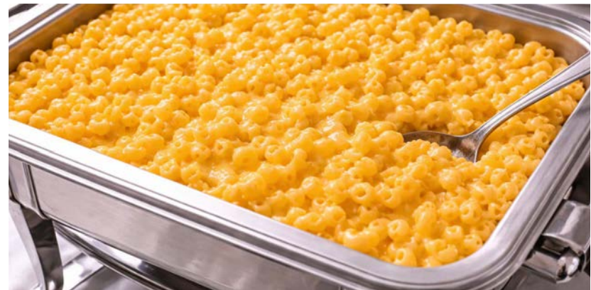
Macaroni and Cheese