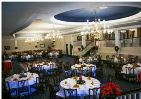
Washington Dining Room