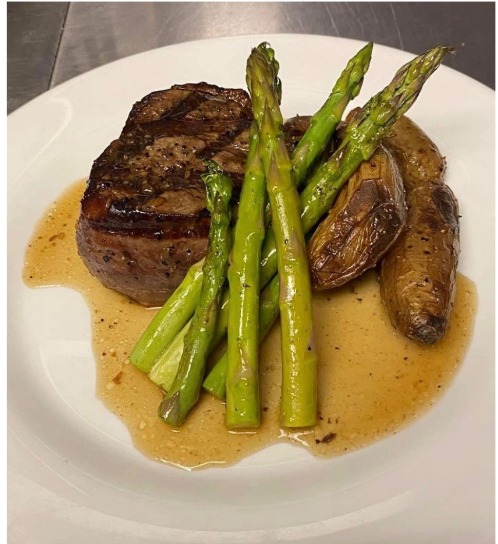
Grilled Beef Filet with Roast Potatoes and Asparagus

Grilled to your specification, optionally topped with sauteed mushrooms and onions. $40 per person Lunch $49.95 per person Dinner