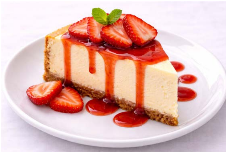
NY Style Cheesecake with Strawberry Topping

Rainbow, orange, mango, or lemon $3.00 per person