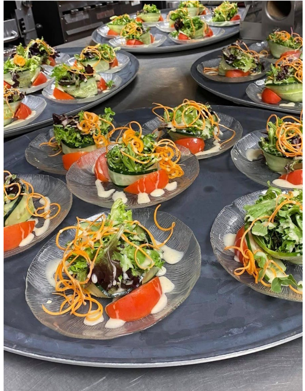
Plated Mixed Greens Salad