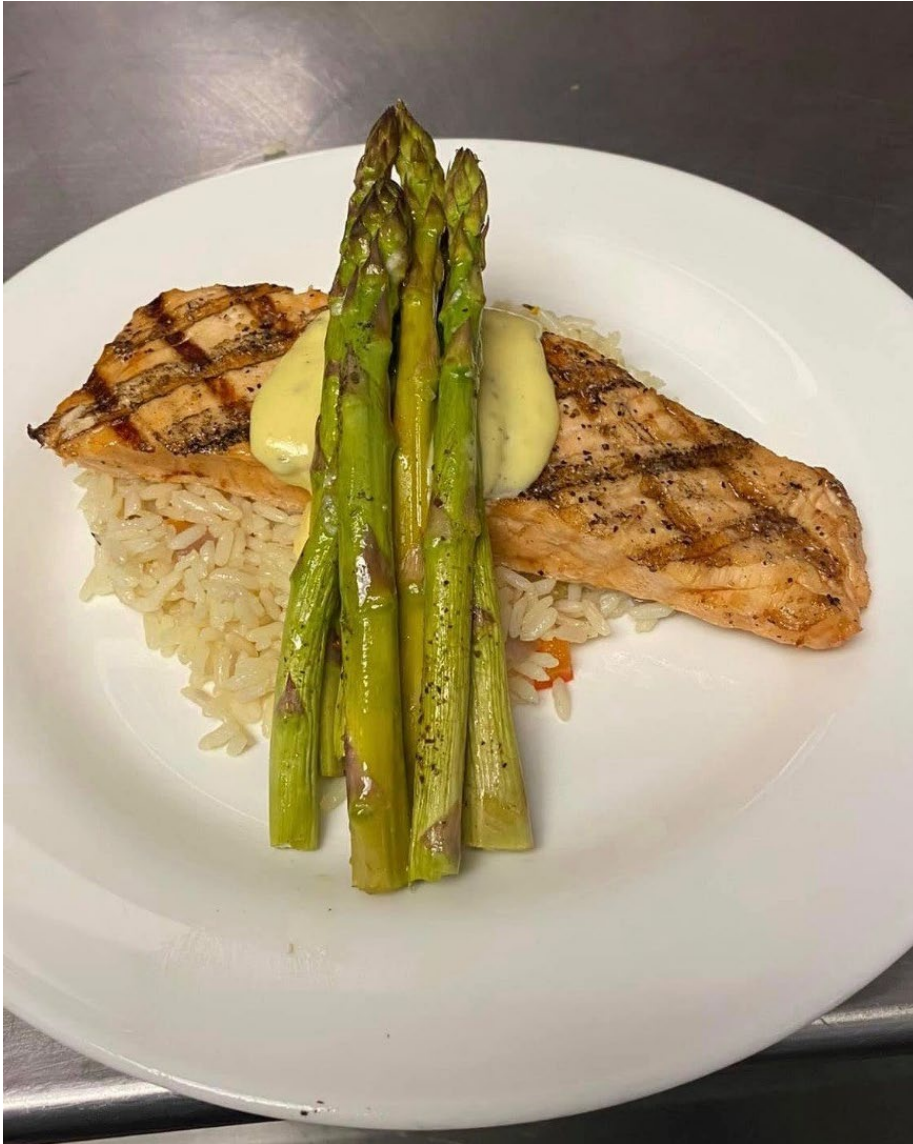
Grilled Salmon with Rice Pilaf and Asparagus

Minimum Guest Guarantee 20 (lunch), 30 (dinner)