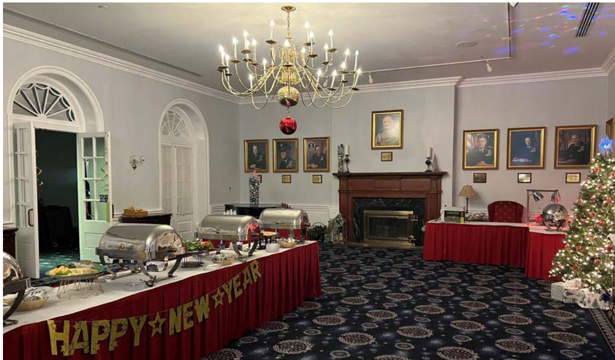
Buffet in the Spatz Room during the Holidays