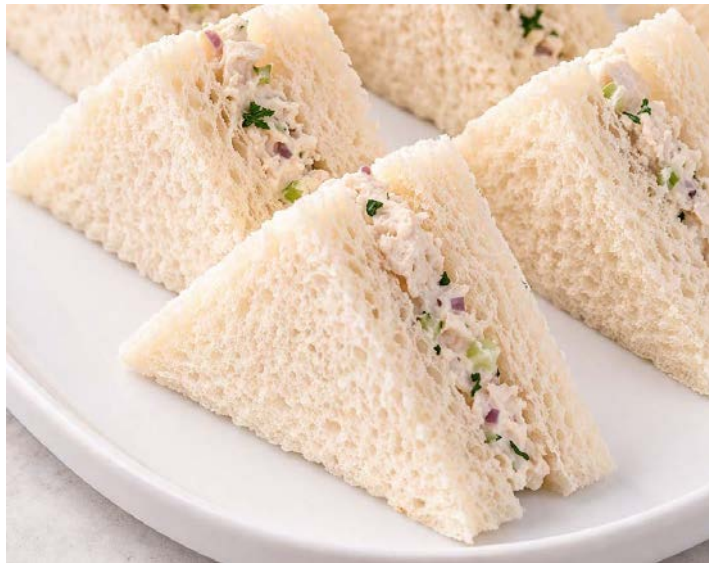
Chicken Salad Mini Sandwiches