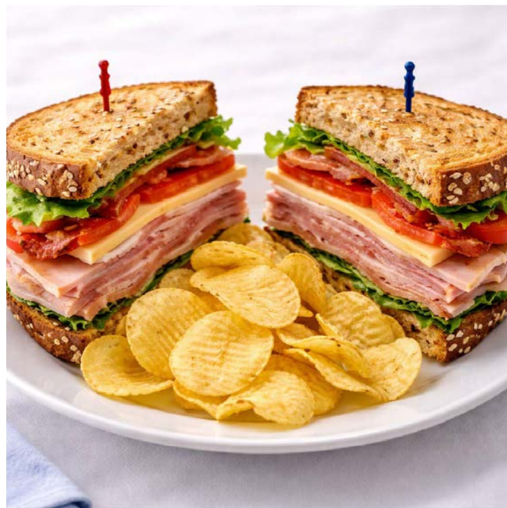
Classic Club Sandwich with Chips