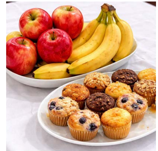
Whole Fresh Fruit and Mini Muffins