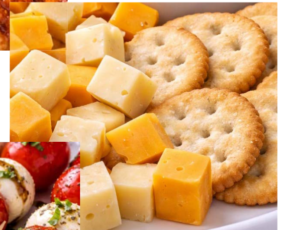
Cheese and Crackers