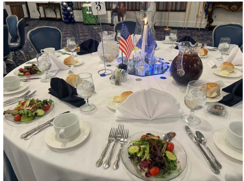
Plated Dinner in the Capital Ballroom