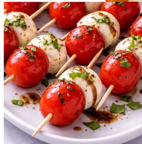
Mini Caprese Skewers