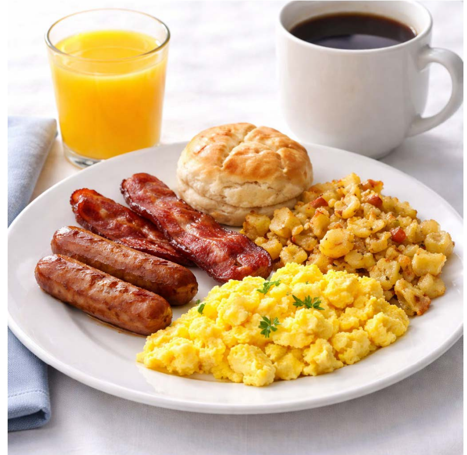
Sunrise Start Breakfast