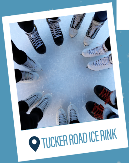
TUCKER ROAD ICE RINK